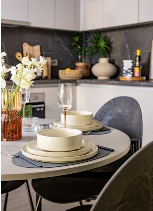
DINING TABLE & CHAIRS

Our interior designers have curated a premium-quality furniture package including bespoke pieces all set up and ready for when you move in. Prefer to BYO? Nae bother. Speak to a member of our team to see if we have any unfurnished options still available.