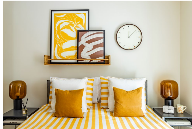
KING-SIZED BED & BED SIDE TABLE